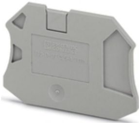
End cover, length: 56.8 mm, width: 2.2 mm, height: 39.8 mm, color: gray

Please be informed that the data shown in this PDF Document is generated from our Online Catalog. Please find the complete data in the user's documentation. Our General Terms of Use for Downloads are valid ( http://phoenixcontact.com/download )